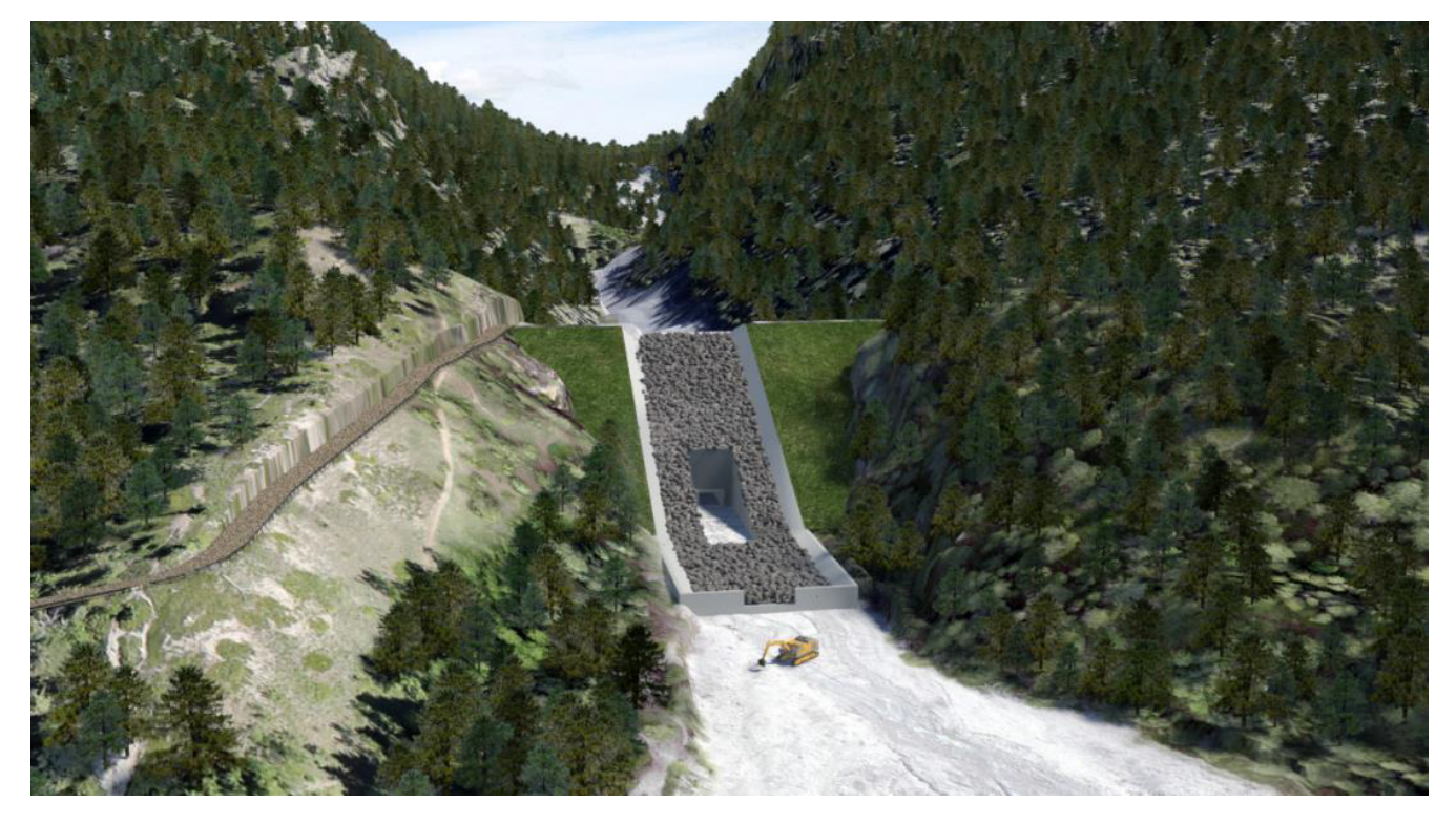
Figure 3 Town of Canmore Debris Flood Retention Structure Rendering