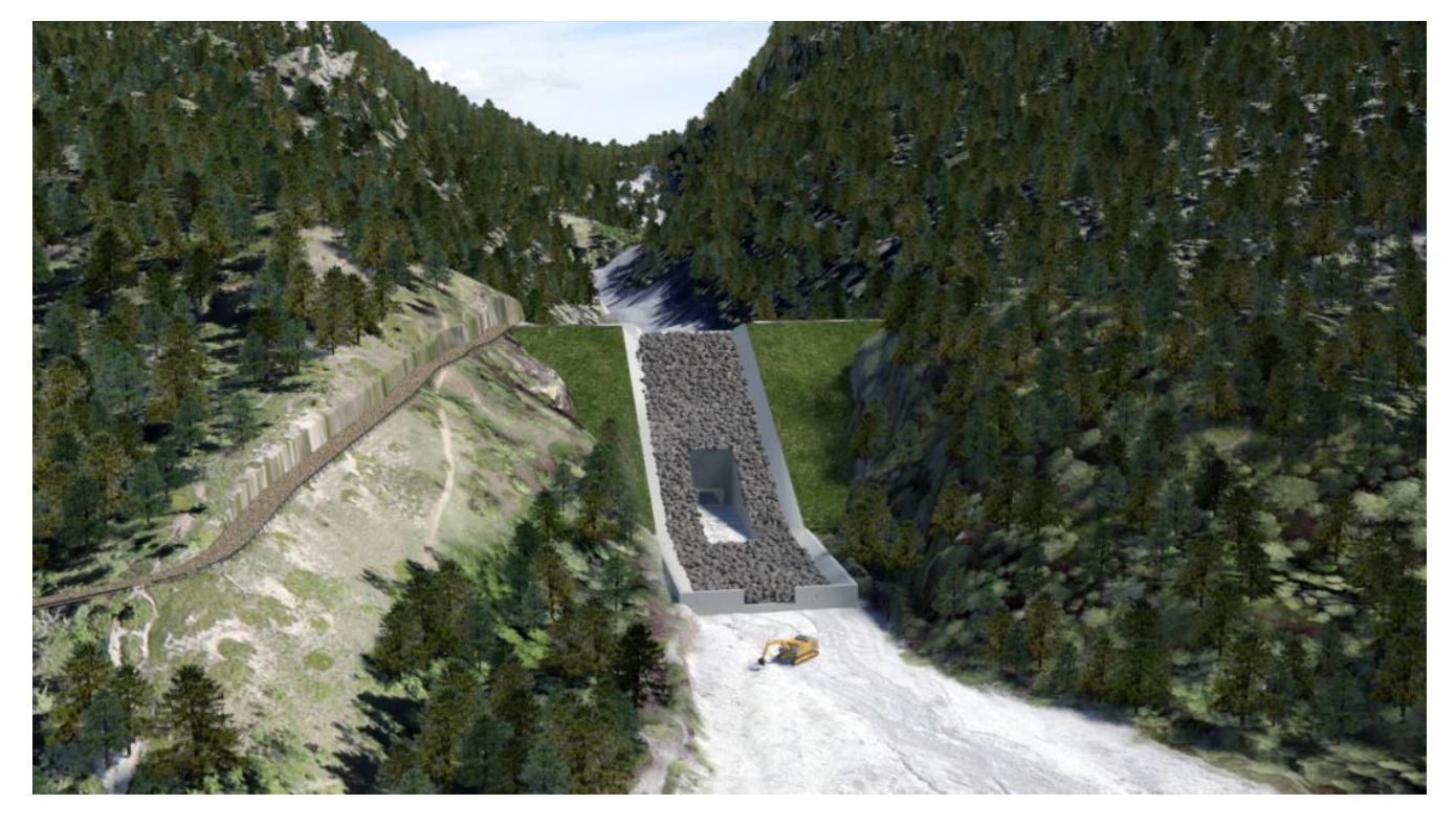
Figure 3 Town of Canmore Debris Flood Retention Structure Rendering