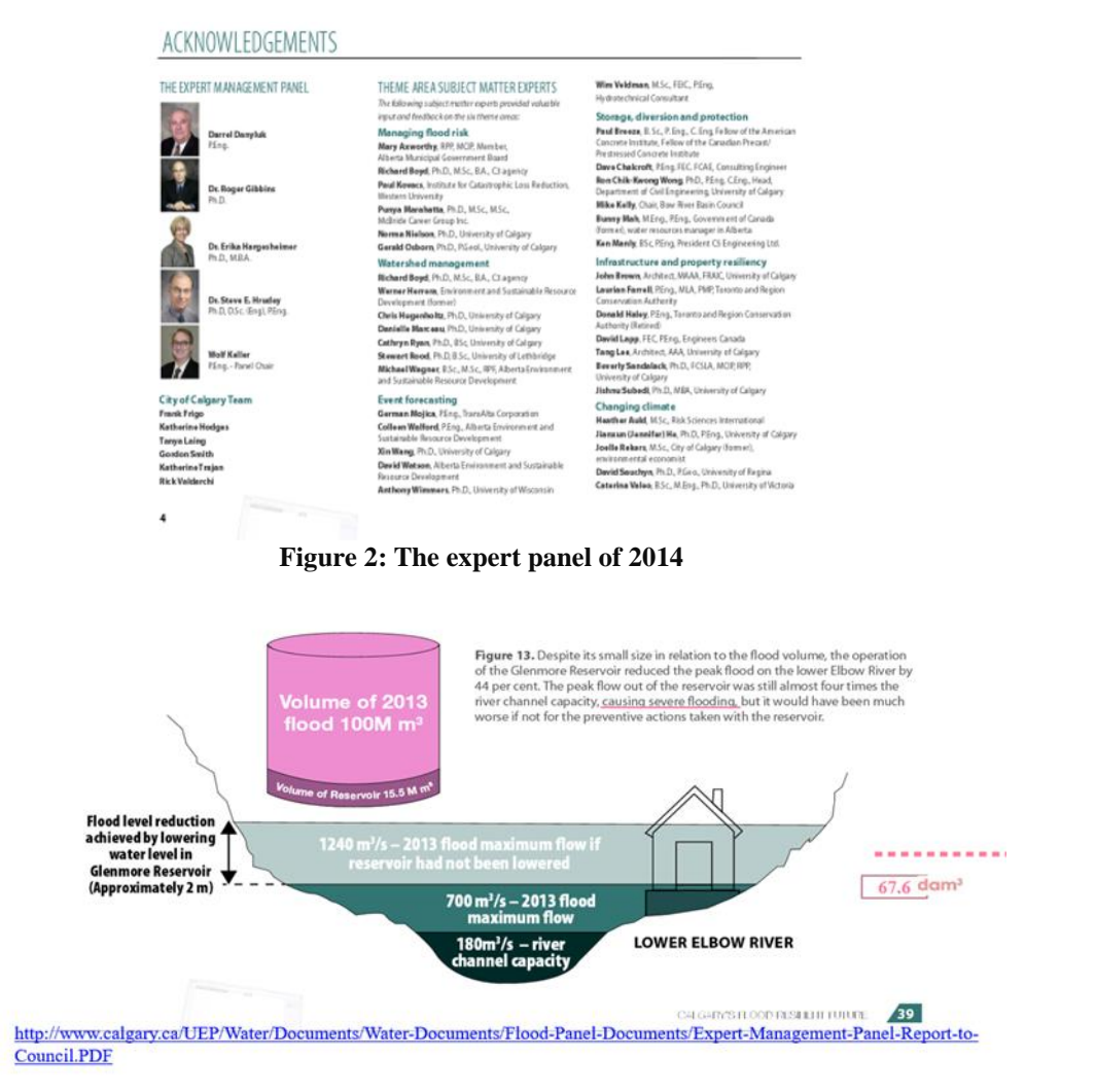
Figure 3: Volume Of 2013 flood-100M m<sup>3</sup> (June 2014)