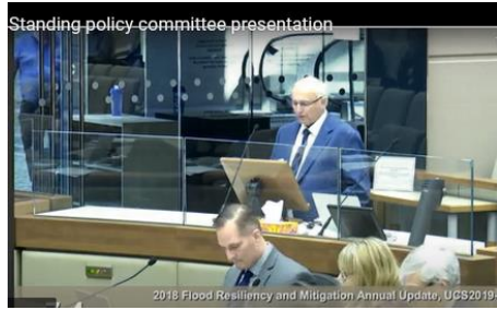
Figure 7: Short Presentation to Calgary City Council (FWMC member): https://youtu.be/23KODLqbGdU

Figure 6: Existing dams and reservoirs in K-Country