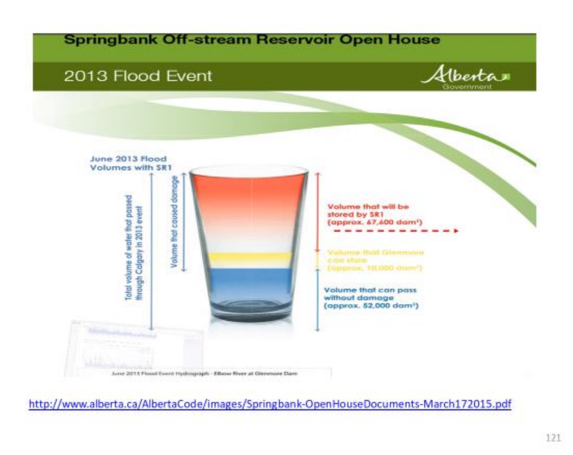
Figure 4: Volume that will be stored by SR1 (provided by Alberta Transportation)