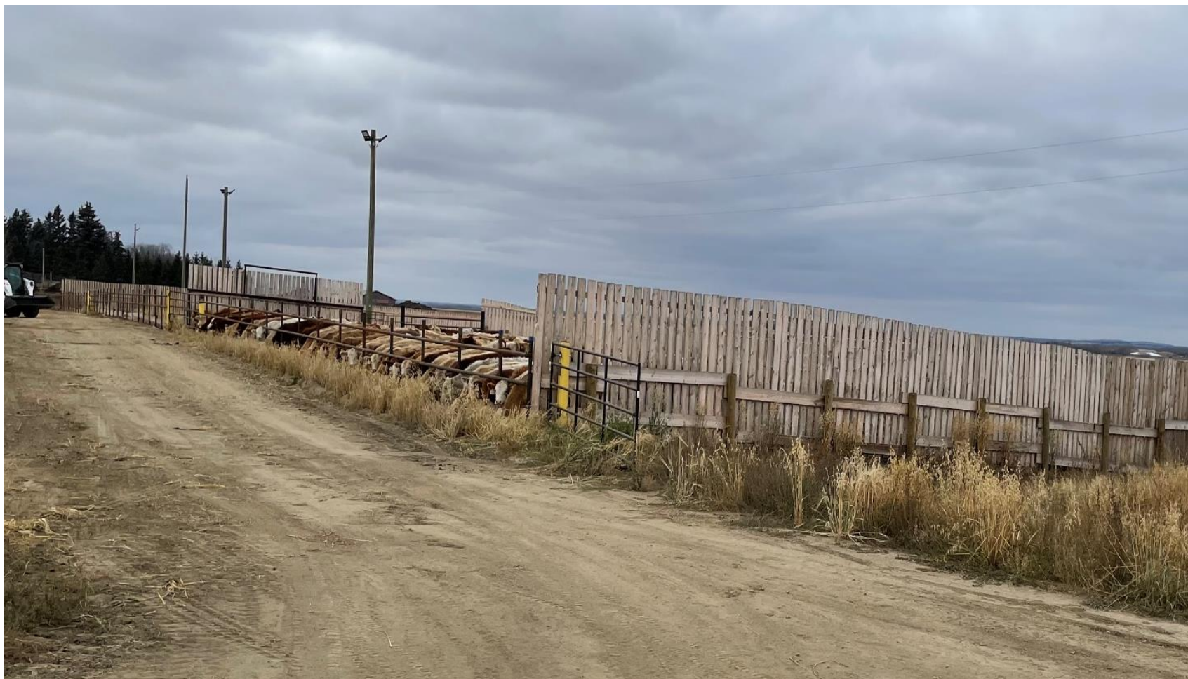
Looking northwest from RR33 – NORTH PENS