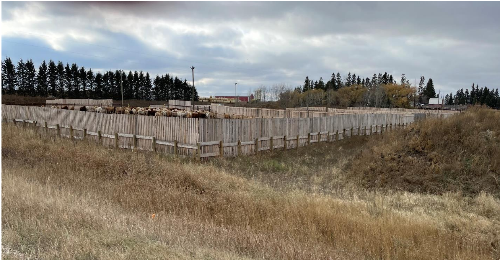
Looking southwest from the corner of RR33 & Hwy 45 (Twp Rd 533) – NORTH PENS Unauthorized Construction (Backgrounders – 6 pens x 200 head/pen = 1200 head)