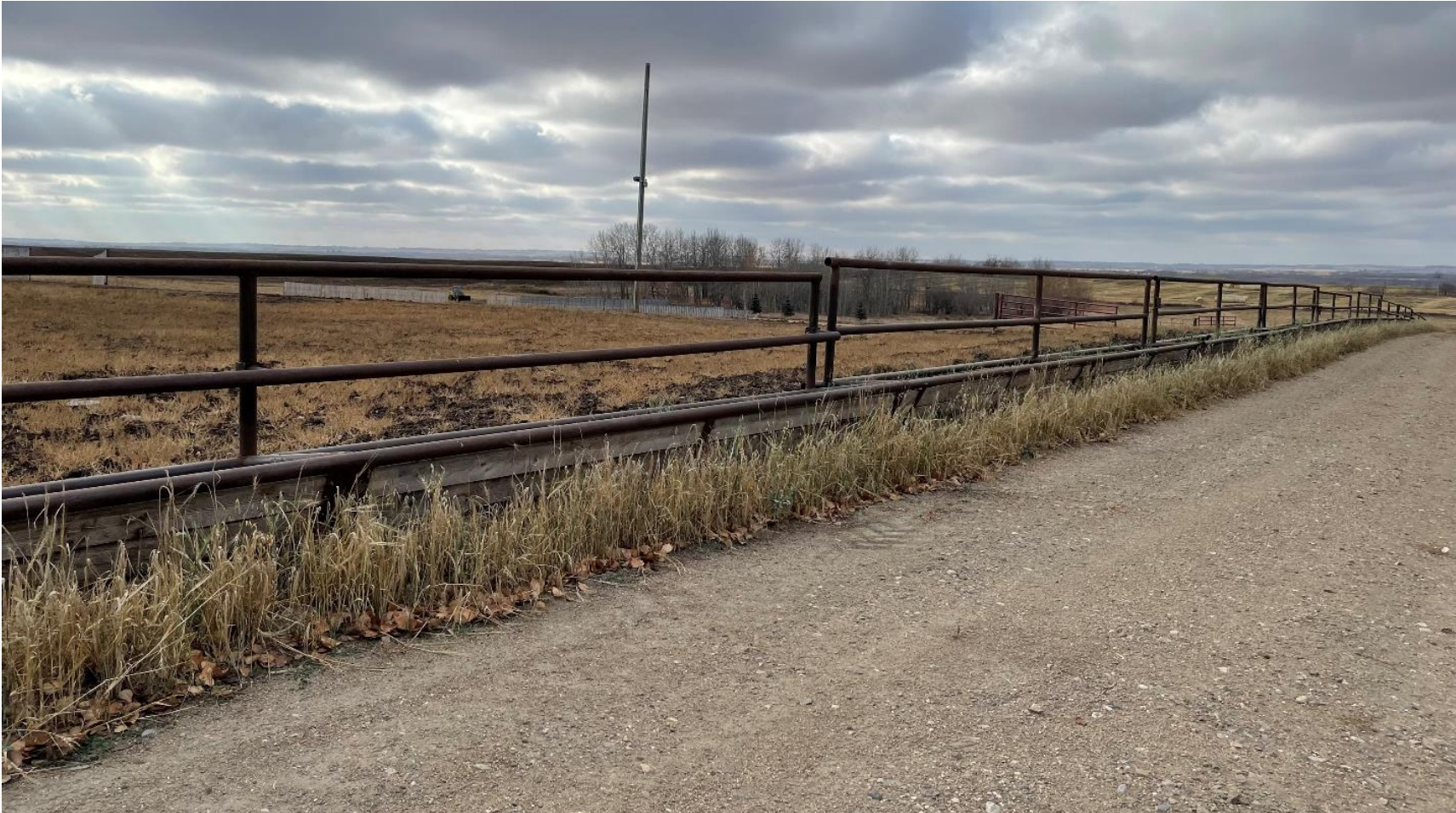
Looking west at the 3 large south pens with external fence line feed bunks – SOUTH PENS