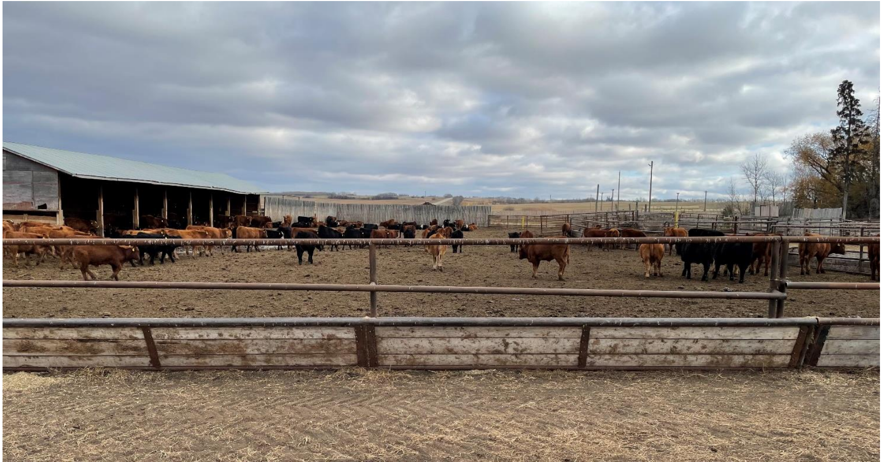
Looking east from the west side of the existing pens directly adjacent Hwy 45 (Twp Rd 533) – MAIN PENS