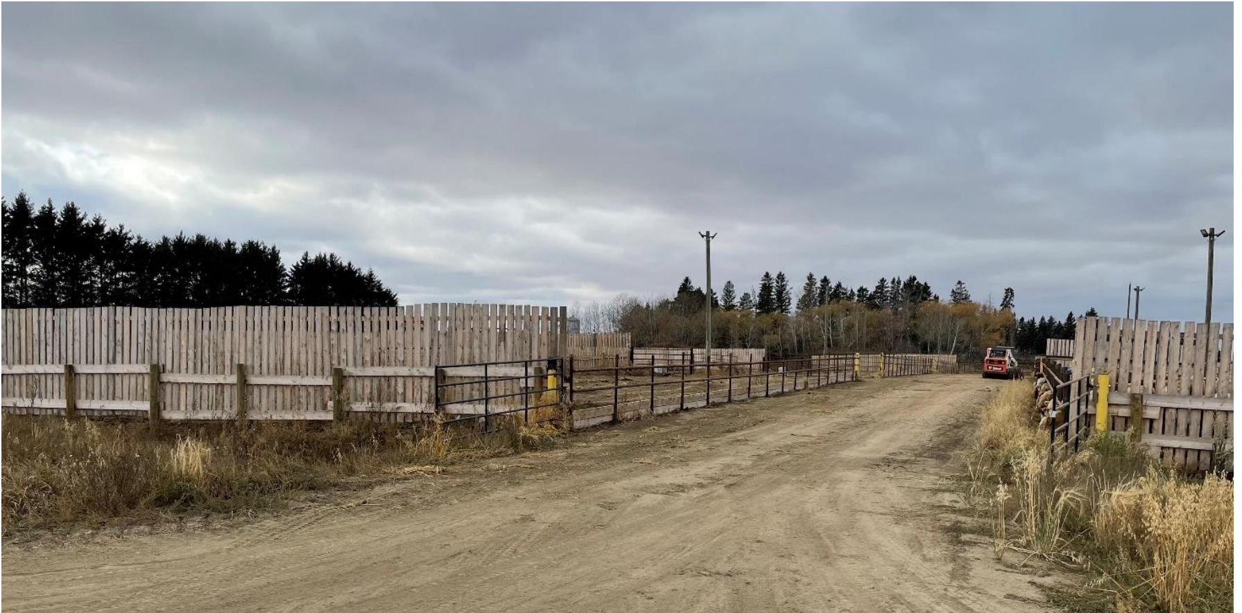
Looking west from RR33 – permanent fencing, fence line feeding – NORTH PENS