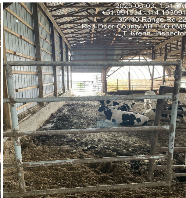
Close-up pen #5